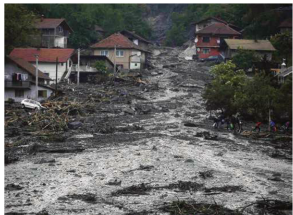
Flooding, Bosnia. May 2014

In fact, GRACE has been so successful that a follow-on mission, the German-American GRACE-FO, is already in its implementation phase and is scheduled for launch sometime in 2017. To get GRACE-FO into orbit as quickly as possible, it will essentially be a